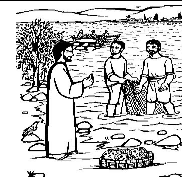
"Come after me, and I will make you fishers of men."